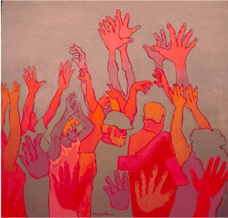
Celebration of Hands

_____ is a better artwork because _____.