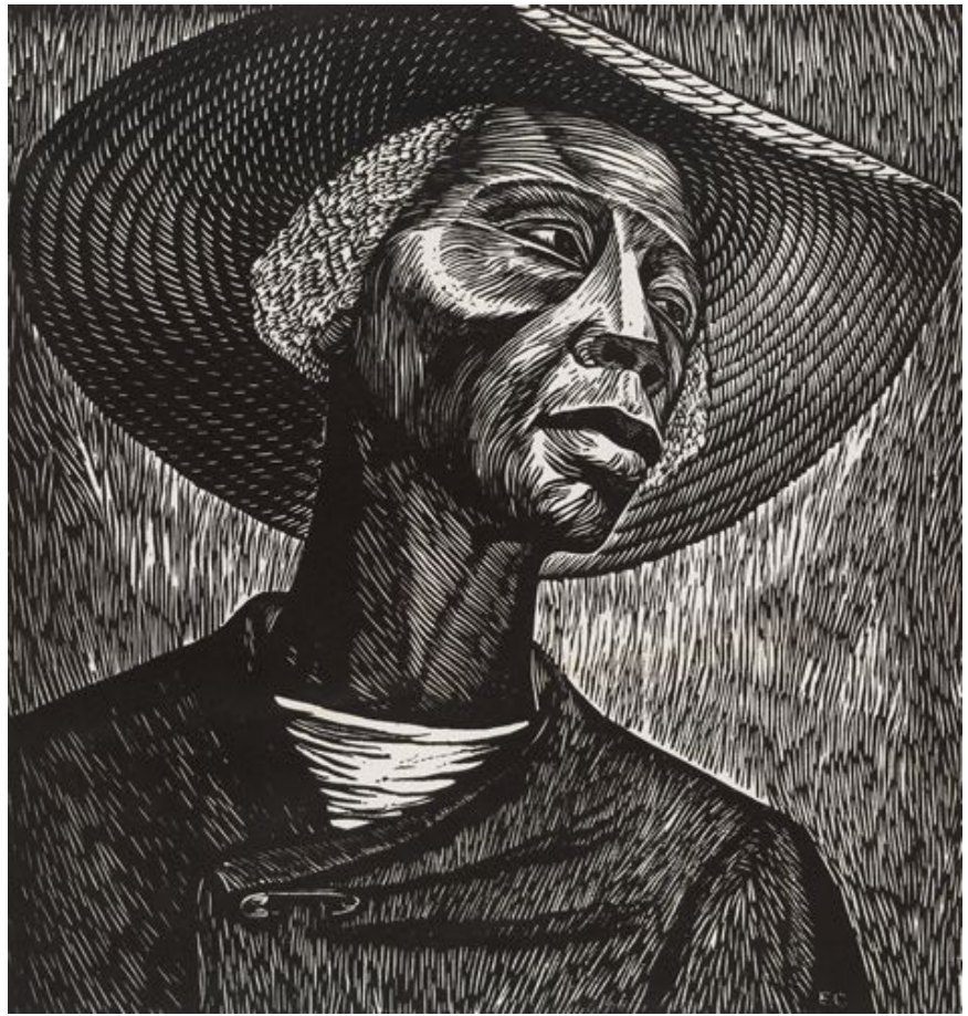
Elizabeth Catlett, Sharecropper, 1952