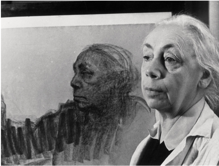
Käthe Kollwitz, The People, 1922