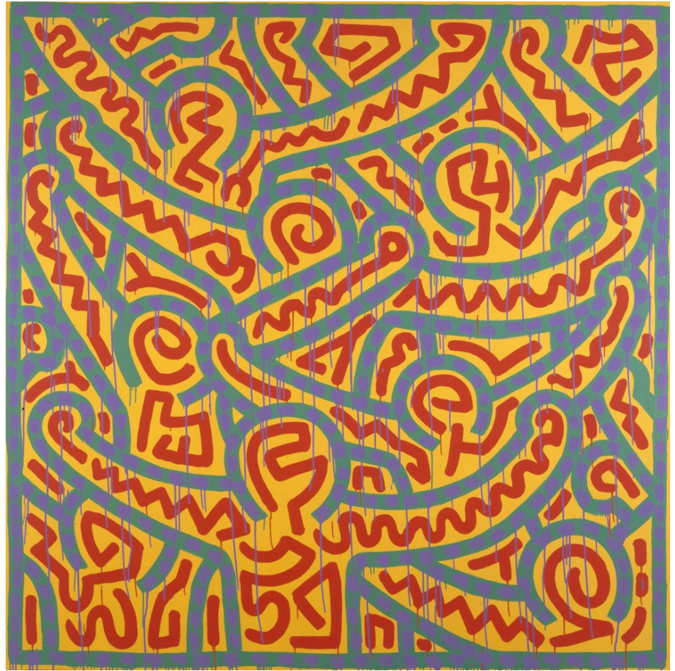
Keith Haring, Untitled , 1989