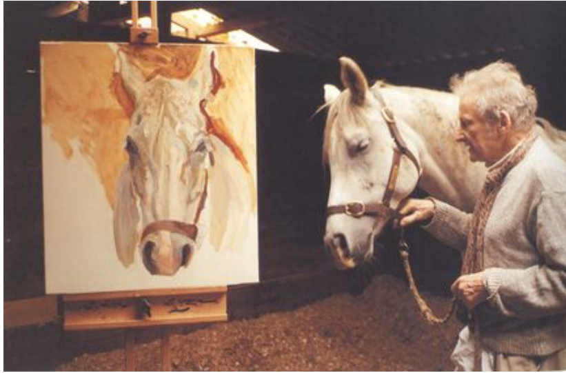
Lucian Freud, Grey Gelding , 2003